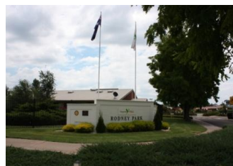
Rodney Park Village 30-50 Knight St, Mooroopna (03) 58320 800