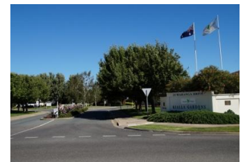
Kialla Gardens Village 15 Waranga Dve, Kialla (03) 58 239 900

For more information or enquiries please contact: Administration Office, Tarcoola